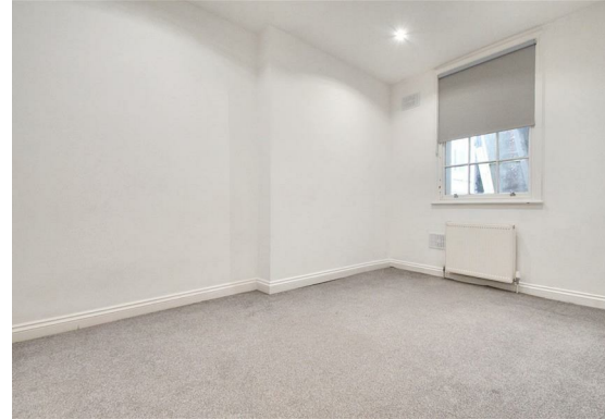
Inner Hallway 16'10 x 3'6 (5.13m x 1.07m)